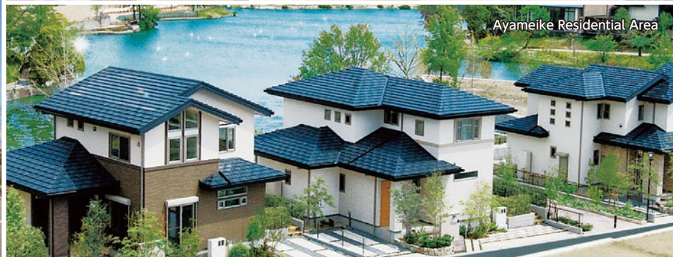
Ayameike Residential Area