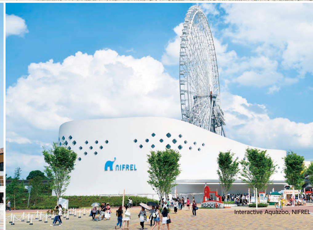
Interactive Aquazoo, NIFREL