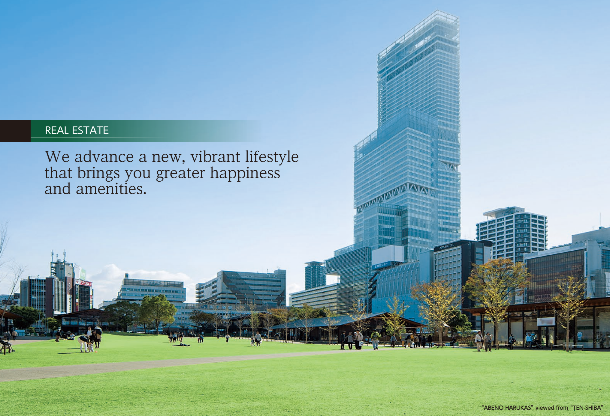
"ABENO HARUKAS" viewed from "TEN-SHIBA"

We advance a new, vibrant lifestyle that brings you greater happiness and amenities.