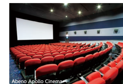
Abeno Apollo Cinema

We manage an integrated resort facility, whose centerpiece is Shima Spain Village/PARQUE ESPAÑA, a theme park full of Spanish charm with various attractions and shows. The resort facility also includes Hotel Shima Spain Mura and the Ise-Shima Natural Hot Spring "Himawari-no-yu." Among our other leisure facilities are the KAIYUKAN, one of the world's largest aquariums; NIFREL, an interactive "aquazoo"; Ikoma Sanjo Amusement Park, with a history of more than 80 years, located at the top of Mt. Ikoma; and Abeno Apollo Cinema, a movie theater. These locations serve as popular spots along Kintetsu Railway lines.