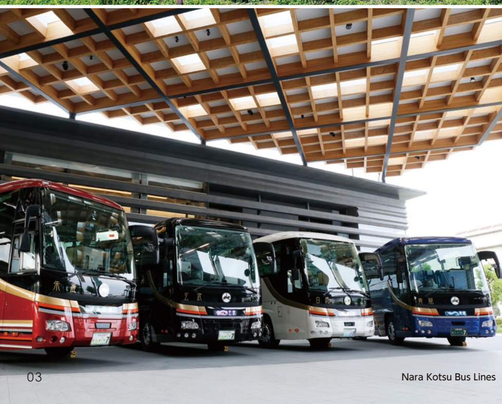
Nara Kotsu Bus Lines