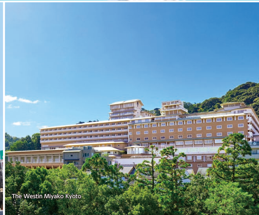
The Westin Miyako Kyoto