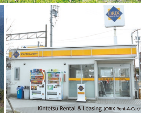
Kintetsu Rental &amp; Leasing (ORIX Rent-A-Car)