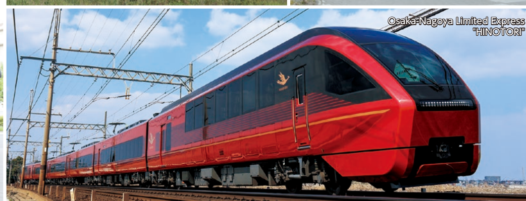
Osaka-Nagoya Limited Express "HINOTORI"