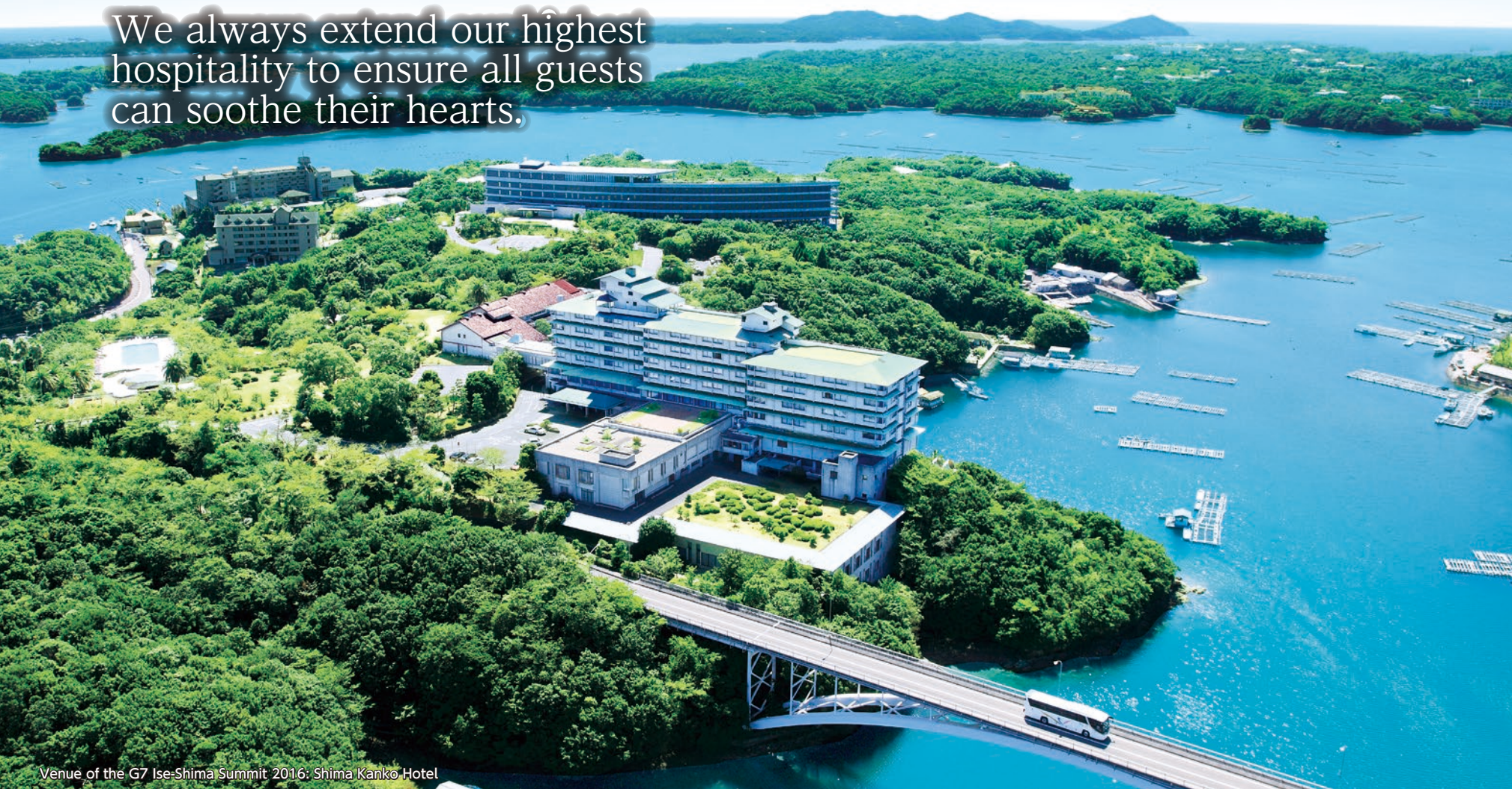
Venue of the G7 Ise-Shima Summit 2016: Shima Kanko Hotel

We always extend our highest hospitality to ensure all guests can soothe their hearts.