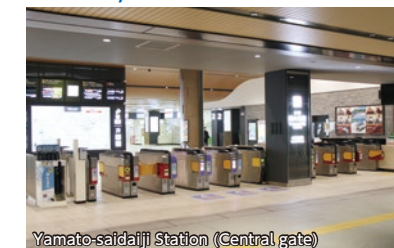
Yamato-saidaiji Station (Central gate)