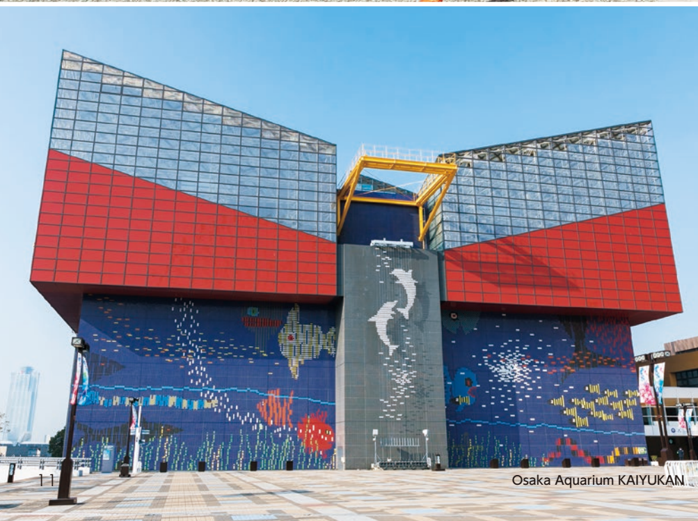
Osaka Aquarium KAIYUKAN