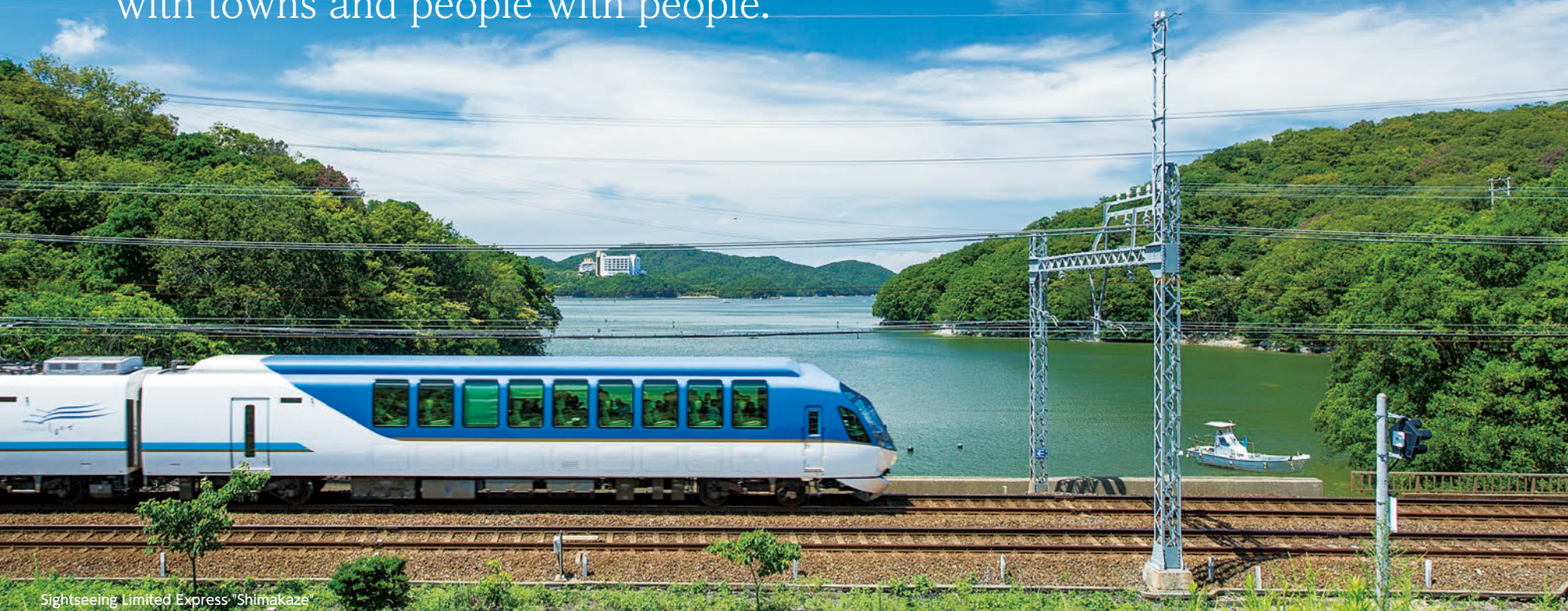
Sightseeing Limited Express "Shimakaze"

With our well-developed transportation network and capacity, we connect towns with towns and people with people.