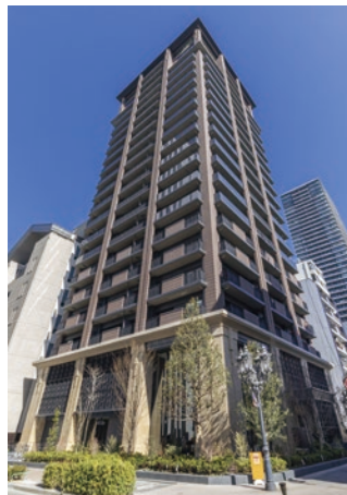
Laurel Tower Nagoya Sakae