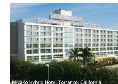
Miyako Hybrid Hotel Torrance, California

•Miyako Hotels & Resorts member facilities