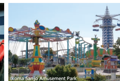
Ikoma Sanjo Amusement Park