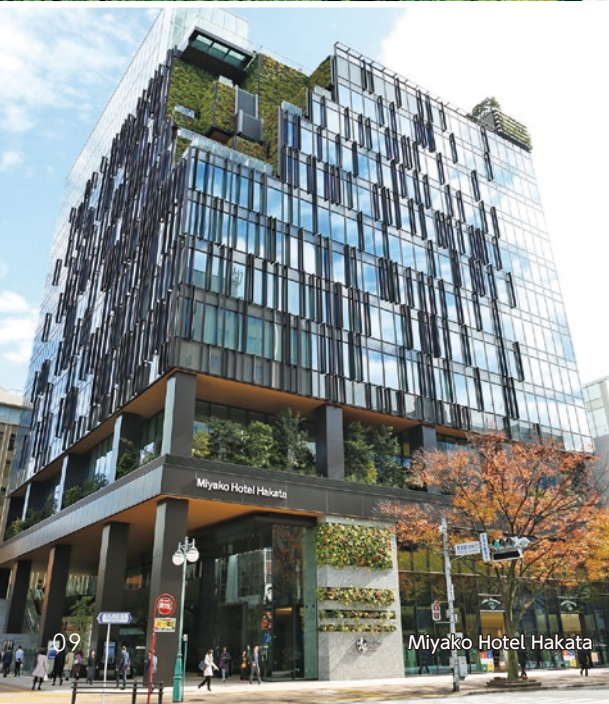
Miyako Hotel Hakata