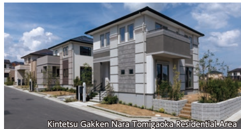
Kintetsu Gakken Nara Tomigaoka Residential Area

With knowledge been passed on for generations, along with novel ideas, we aim to build quality housing with safety guaranteed. We put our energies into quality as well as appearance; some of our condominiums have received Good Design Awards for their stylish designs. Furthermore, we offer new homes that are friendly to family members and the environment by, for example, adopting advanced facilities for energy creation and saving.