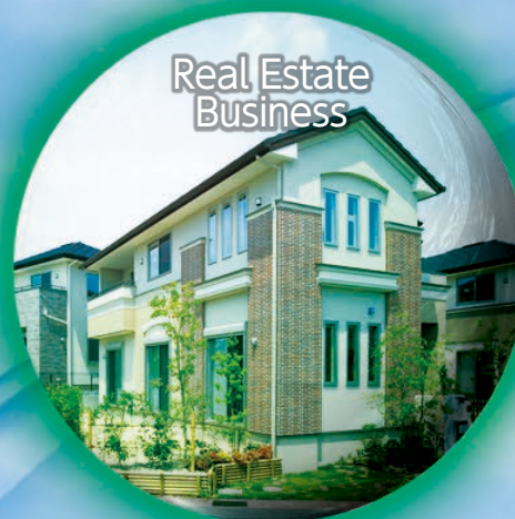
Real Estate Business