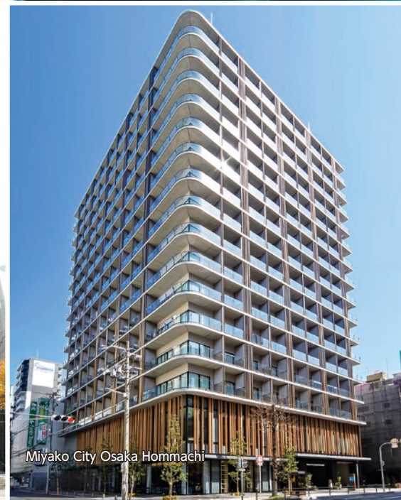
Miyako City Osaka Hommachi