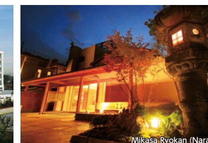
Mikasa Ryokan (Nara)