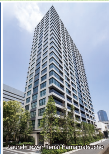
Laurel Tower Renai Hamamatsucho