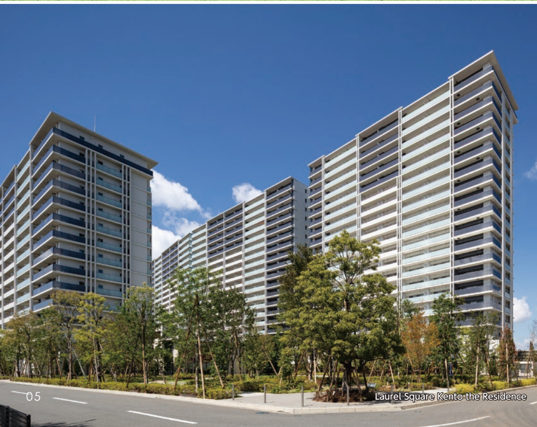
Laurel Square Kento the Residence