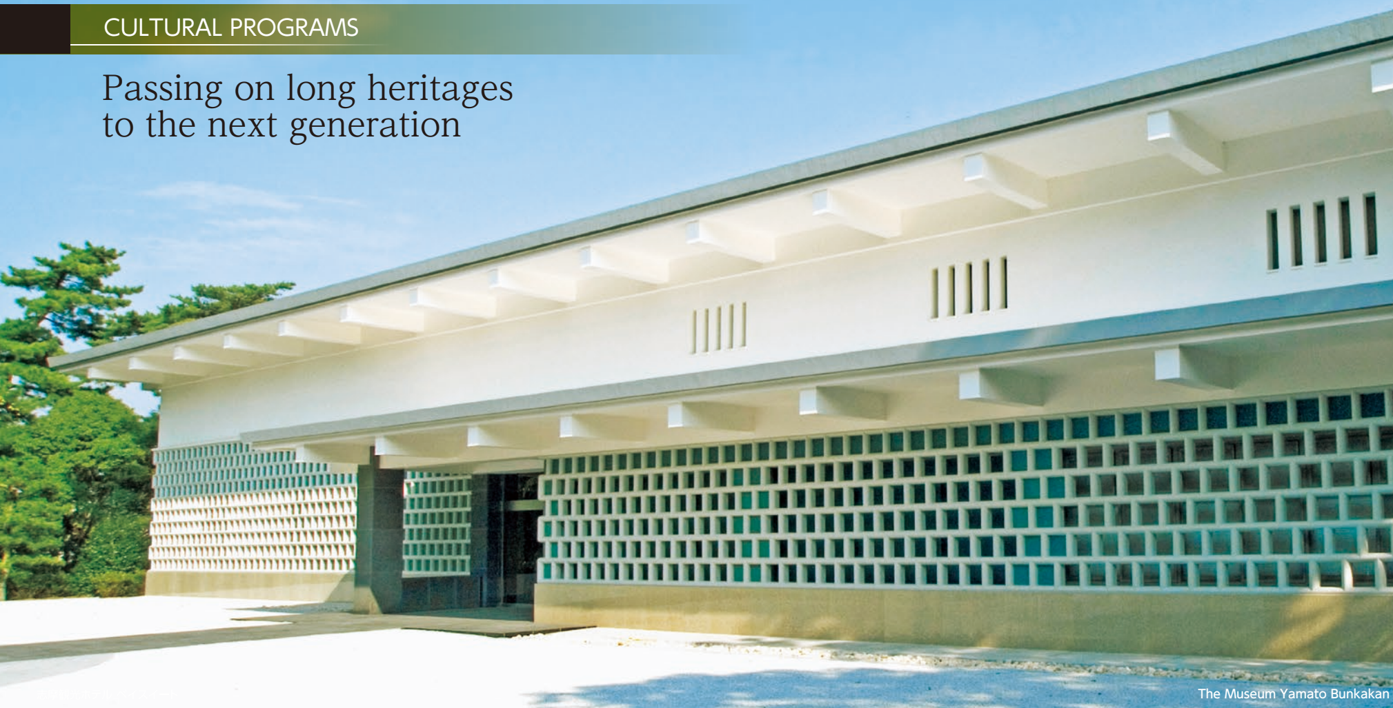
The Museum Yamato Bunkakan