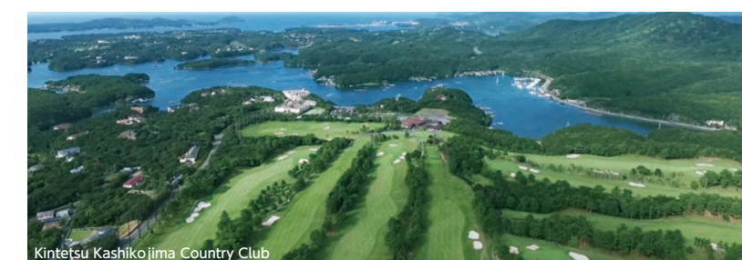
Kintetsu Kashikojima Country Club